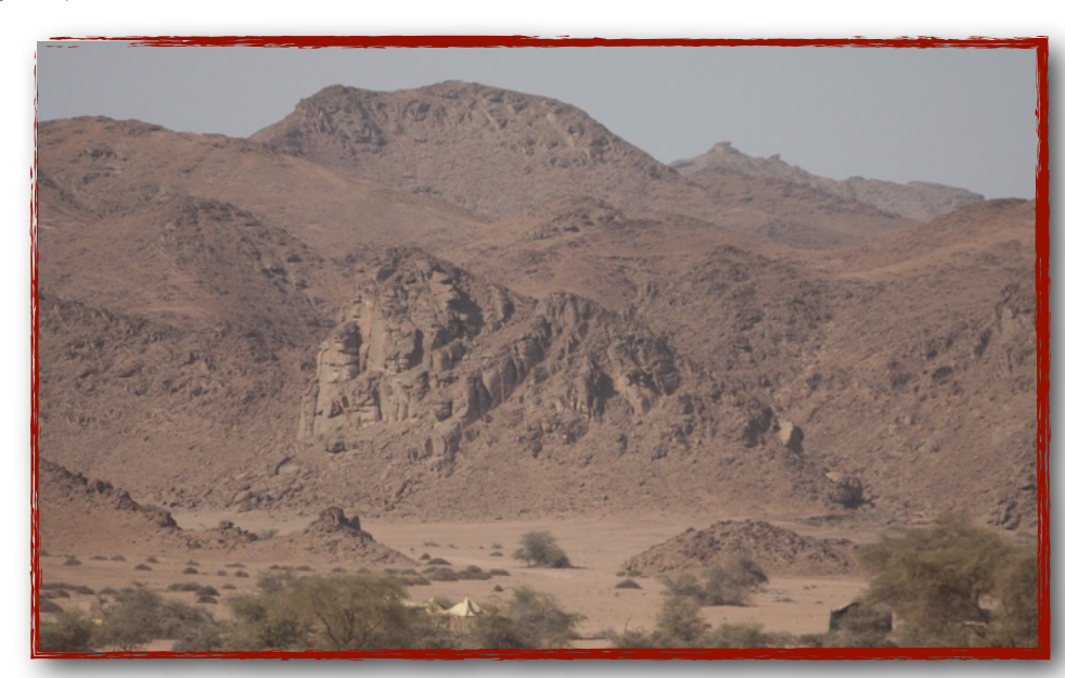
A Step Ahead * Custom Guided Journeys

contrast with the deep blue Atlantic ocean. Colonies of Cape fur seals sunbathe on the shoreline, and jackals and other predators sneak in and out of the masses hoping to find sick, weak or young individuals.